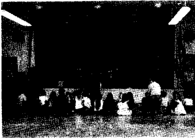
PIERPONT GRAMMAR SCHOOL